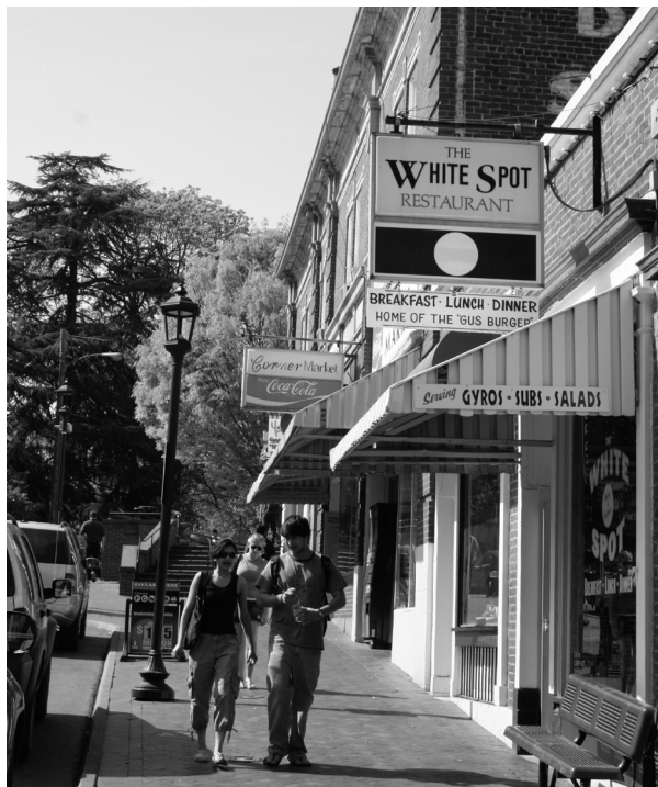
The Corner, near UVA Central Grounds

Antiques. Albemarle and nearby counties are a heaven for antique shoppers. Ask us for the name of our local antiques maven, who will gladly discuss your options!