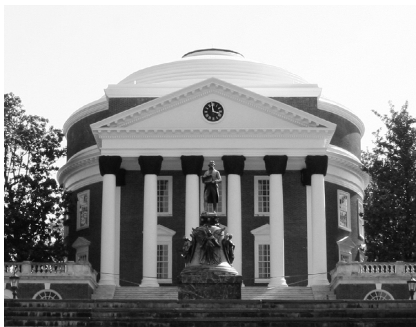
Jefferson's Rotunda at UVA

Arts. For a town of its size, Charlottesville has a robust art scene, including several small galleries (many of which are situated on or near the Downtown Mall), a handful of festivals, a drama venue ( www.livearts.org ), several music venues, and more. Consult the city's website for more information.