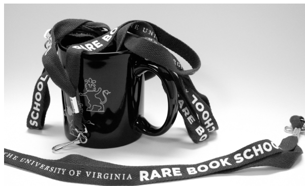
Merchandise from the RBS Notions Shop

* Required activities are noted by asterisk